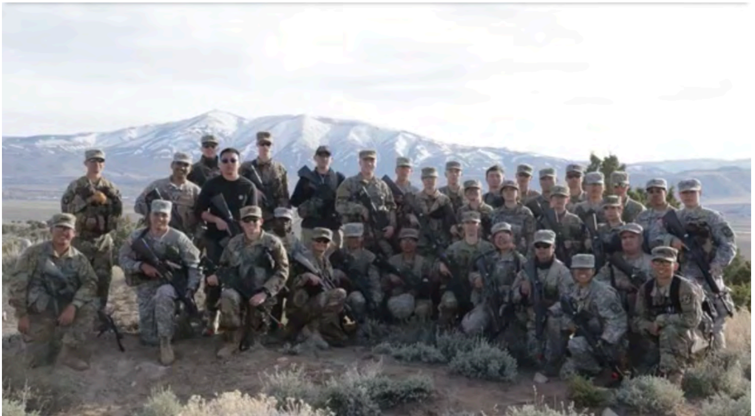
2019 JFTX. Picture is a mixture of CSUS, UCD , UNLV and UNR Cadets.