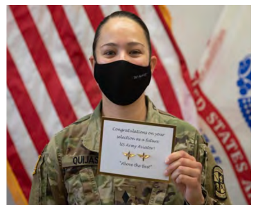
CDT Quijas after getting her top branch preference: Aviation!