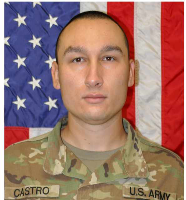
CDT Fidel Castro Cadet Battalion Command Sergeant Major

“Check up on your cadets. Sometimes it's a good idea to ensure that something reached the lowest level by calling and checking in on the lowest level.”