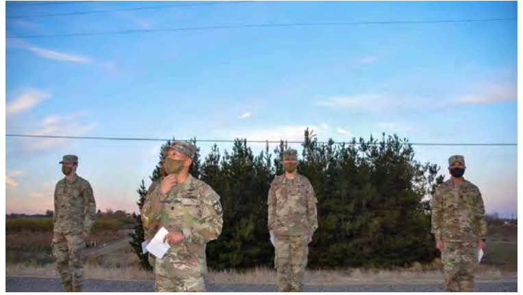
Branching ceremony for the MSIVs.