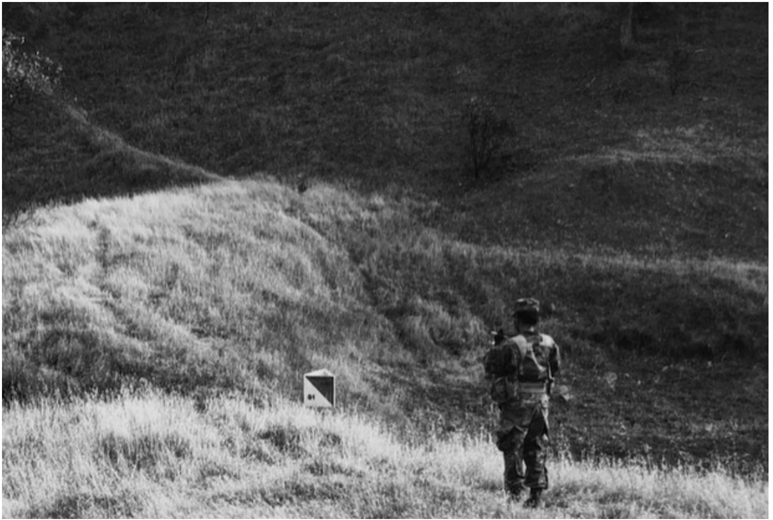
Cadet Angara locating a point during day land navigation at Judge Davis Trailhead.