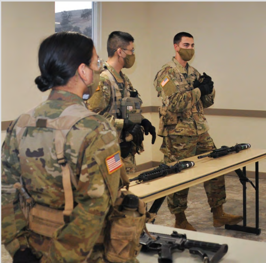
Cadets conducting a weapons safety brief while adhering to social distancing procedures.