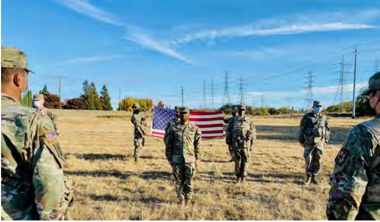
Contracting ceremony at CSUS.

In November, we held a contracting ceremony to welcome the new members of the team and their commitment to become future leaders in the U.S. Army. We also had the honor to watch the faces of our MSIVs and MSVs after discovering the branch they were assigned!