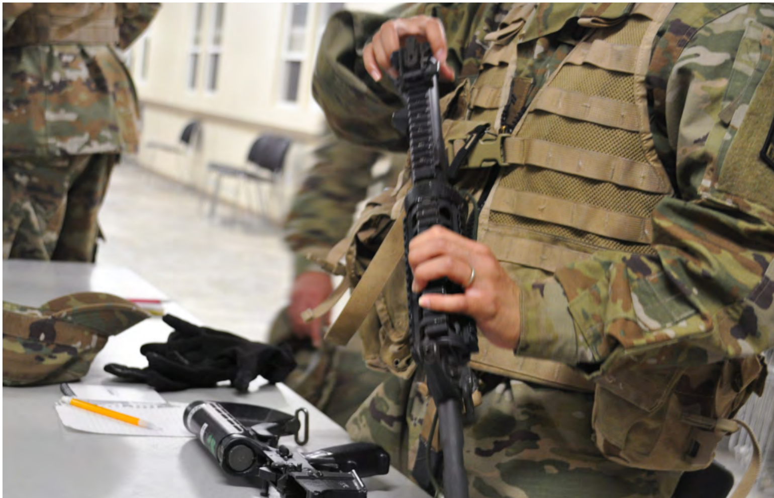
A cadet demonstrating the disassembly of the M4 Rifle during the instruction portion of the exercise.