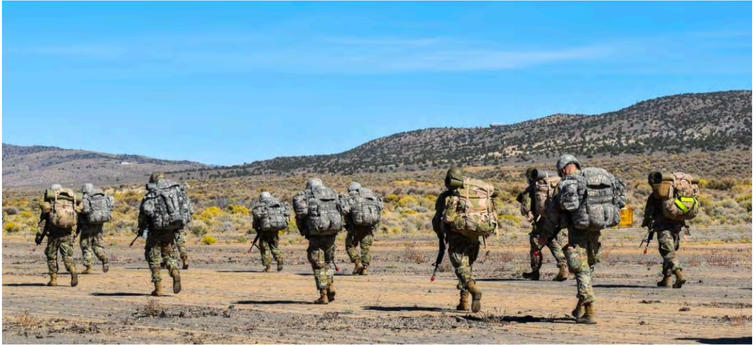
Cadets conducting a road march during Operation Agile Leader in Reno, Nevada.